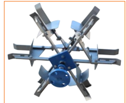
5C-4 Collapsible Coiler with Slide Drive Adapter