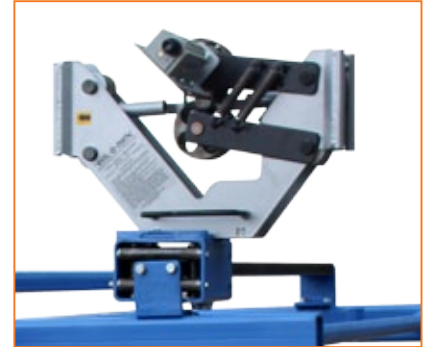
Model 1700A Measurer on Slide Traverse