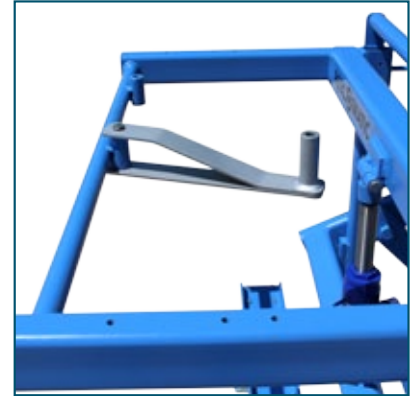
Meter Swing Arm