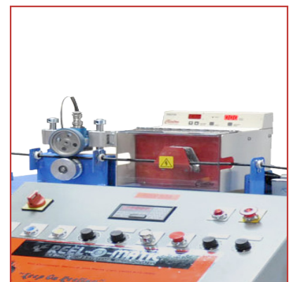
Clinton Spark Tester