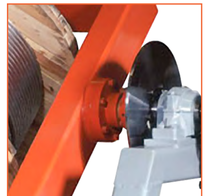
Integrated Cradle Hold Brake