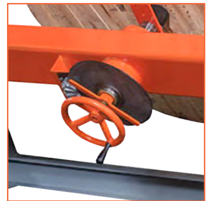
Reel Tension Provided by Manual Disc/Caliper and Optional Electric Available