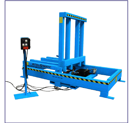
RU10 Special for Reels 96" x 60" wide