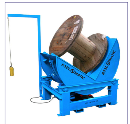
Custom Designed RU10