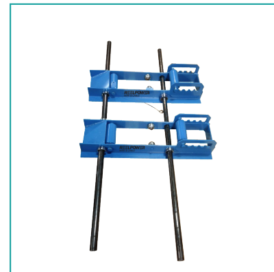
Model 600 Adjustable Reel Roller Platform