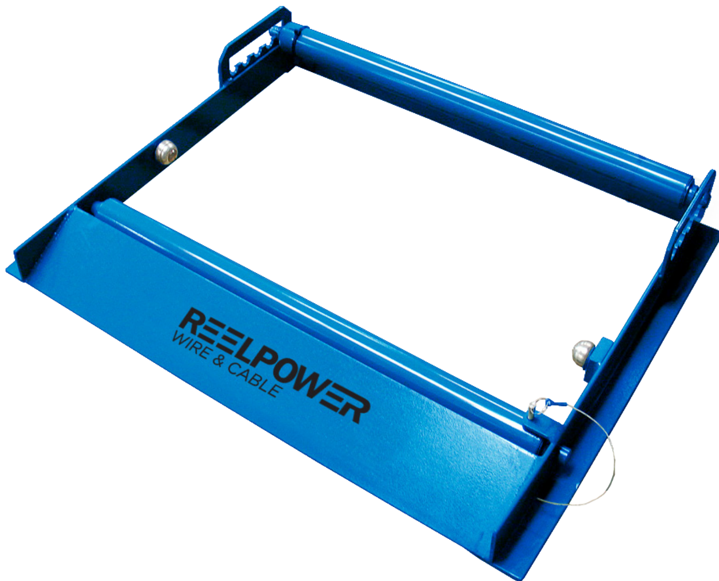
Model 280S, 300S, and 360S

Tough structural steel frame and front roller locks to ease reel removal. side rollers are Included. Low base design to avoid damaging of cable inside reel. Rugged steel “angle” construction with steel plate ramp.