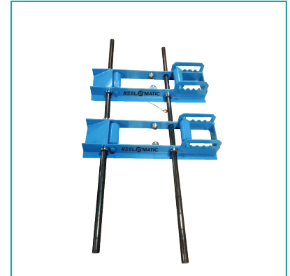
Model 600 Adjustable Reel Roller Platform