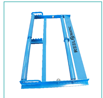
480 DW - 48" Wide * Two Reels - 24" Wide