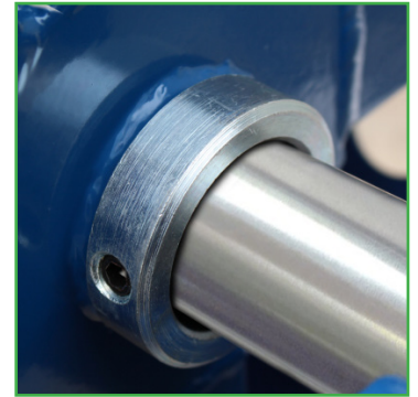
Standard 2 1/8" Locking Reel Collar