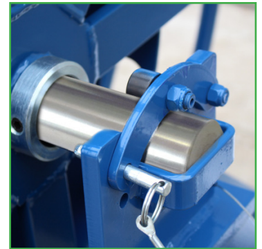
Standard Shaft Safety Locks