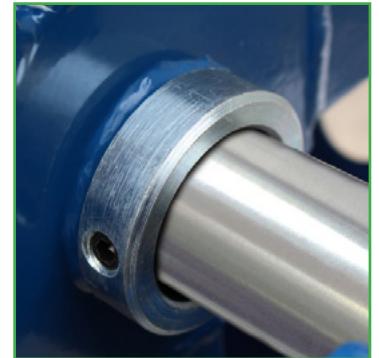
Standard 2 1/8" Locking Reel Collar