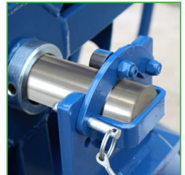
Standard Shaft Safety Locks