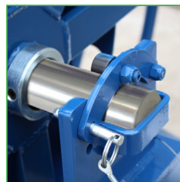
Standard Shaft Safety Locks