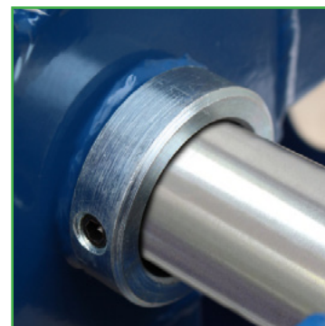
Standard 2 1/8" Locking Reel Collar