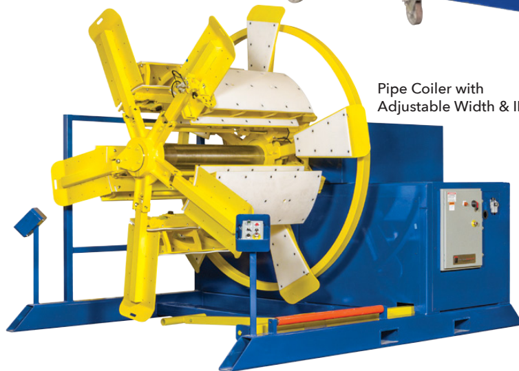
Pipe Coiler with Adjustable Width & ID