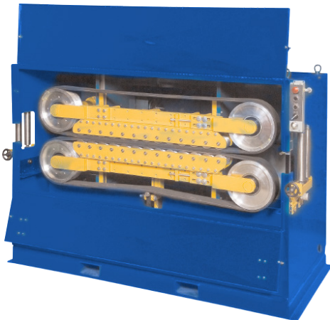
CC48 Caterpuller Capstan