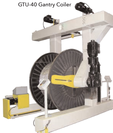
GTU-40 Gantry Coiler