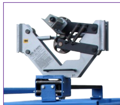
Model 1700SP Meter and Slide Traverse