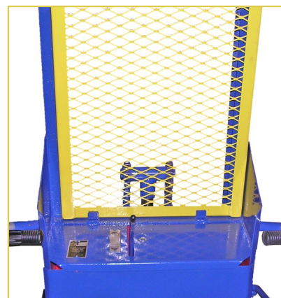
Simple "Up/Down" Control