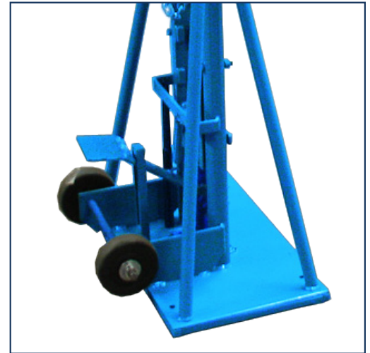
Foot Operated Hydraulic Jack

Shaft saddles may be set for a number of vertical positions so that a minimum of foot pedal “jacking” is required.