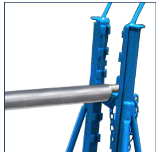
Adjustable Shaft Saddle