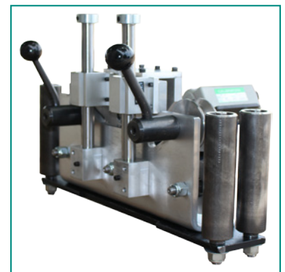
Adjustable Tensioning Guides