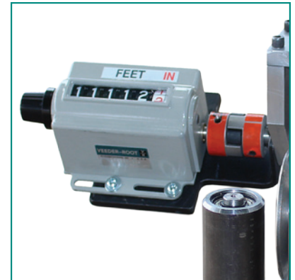
Analog Measurer Feet/Inches