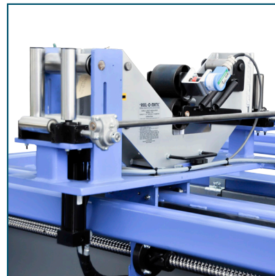
Automated Slide Traverse