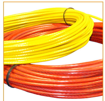
Available in Multiple Lengths to Meet Your Company's Needs