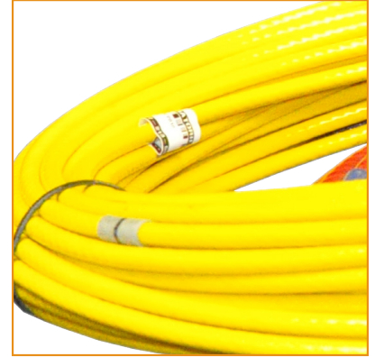
Marked at Start and Stop Points